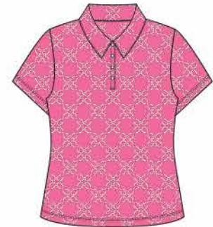
GC0591-1774 SANIBEL Performance Jersey, Snap Placket, 7.5" Sleeve, SPF 45+, 91% Polyester, 9% Spandex, Filigree Print, XS-XXL B3950