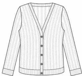
GB0580-0014 SANDBAR SWEATER Cable Knit Cardigan Sweater, Agoya Shell Buttons 60% Cotton, 40% Rayon White, XS-XL B3950