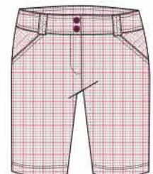
GC4242-1884 KINGSTON SHORT Modern Fit, Stretch Woven, Button Closure, Back Pocket, 21" Outseam, SPF 45+, 64% Polyester, 34% Rayon, 2% Spandex, Pink Punch Check, 2-18 B3950