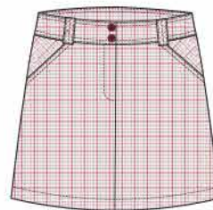
GC4243-1884 KINGSTON SKORT Modern Fit, Stretch Woven, Button Closure, Back Pocket, 17" Outseam, SPF 45+, 64% Polyester, 34% Rayon, 2% Spandex, Pink Punch Check, 2-16 B4250