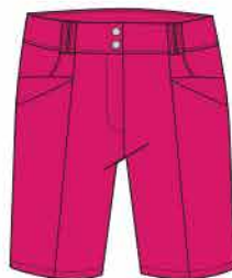
GC4240-6184 DORADO SHORT Tail Tech Fit, Stretch Woven, Novelty Pocket, Back Pockets, 21" Outseam, SPF 45+, 94% Polyester, 6% Spandex, Pink Punch, 2-18 B3750