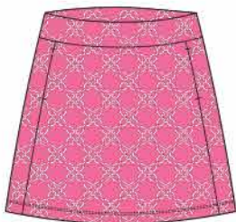
GC4202-1774 FUN SKORT Performance Jersey, Straight Pull-On, Front & Back Pockets, 18" Outseam, SPF 45+, 91% Polyester, 9% Spandex, Filigree Print, XS-XL B4250