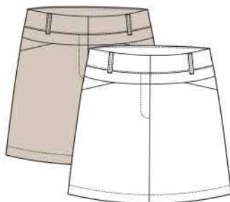
GX4256 TECH SKORT Tail Tech Fit, Stretch Woven, Body Shaper, Back Pocket, 18" Outseam, SPF 45+, 94% Polyester, 6% Spandex, Chino (114X), White (001X), 2-18 B3750