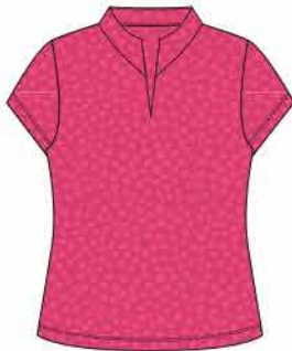
GC0590-1584 RIVERSIDE Shiny Jacquard, Modified Mock Neck, Open Placket, 95% Polyester, 5% Spandex, Pink Punch, XS-XL B3750