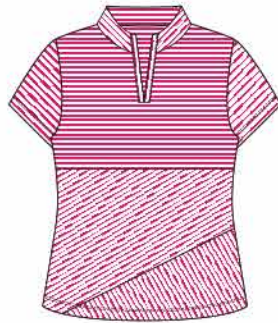
GC0588-1574 LUCAYA Performance Jersey, Mock Neck, Stripe Slicing, 91% Polyester, 9% Spandex, Pink Punch Stripe, XS-XXL B3750