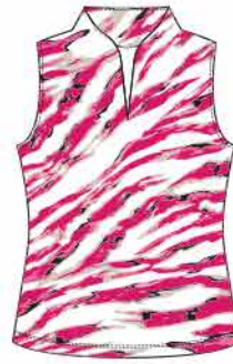
GC0524-6924 MANHATTAN Performance Jersey, Modified Racerback, Shawl Collar, SPF 45+, 91% Polyester, 9% Spandex, Tigress Print, XS-XL B3750