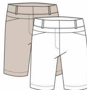
GX4257 TECH SHORT Tail Tech Fit, Stretch Woven, Body Shaper, Back Pocket, 21" Outseam, SPF 45+, 94% Polyester, 6% Spandex, Chino (114X), White (001X), 2-18 B3500