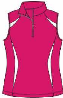
GC0511-6184 AUSTIN Performance Pique, Convertible Collar, Zipper, SPF 45+, 100% Polyester, Pink Punch, XS-XL B3450