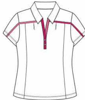
GC0592-0014 HARBOUR Performance Pique, Snap Y-Placket, Piping, Pintucks, SPF 45+, 100% Polyester, White, XS-XL B3450