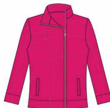
GC0598-6184 PIEDMONT JACKET French Terry Knit, Mock Neck, Asymmetric Zip Front 90% Polyester, 10% Spandex, Pink Punch, XS-XL B4450