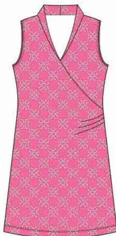
GC0581-1774 HERMOSA DRESS Performance Jersey, Shawl Collar, Faux Wrap Front, SPF 45+, 91% Polyester, 9% Spandex, Filigree Print, XS-XL B4450