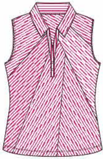
GC0585-1574 EXUMA Performance Jersey, Button Y-Placket, Stripe Slicing, 91% Polyester, 9% Spandex, Pink Punch Stripe, XS-XL B3450