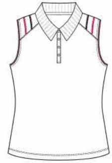
GC0587-0014 KIMBERLY Performance Pique, Knit Collar, Snap Placket, Piping, SPF 45+, 100% Polyester, White, XS-XL B3250