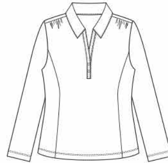
GA0564-0014 WHISTLER Performance Pique, Button Y-Placket, Piping, Rouching, SPF 45+, 100% Polyester, White, XS-XL B3750